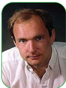
Sir Tim Berners-Lee

While an independent contractor at CERN, Berners-Lee proposed a project based on the concept of hypertext, to facilitate sharing and updating information among researchers. "I just had to take the hypertext idea and connect it to the TCP and DNS ideas and ta-da! - the World Wide Web".